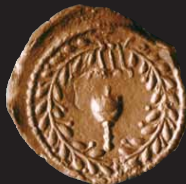
Romano-Maltese Sextans AE The First Coin of Malta (c. 211 BC)

The Central Bank of Malta hopes that this permanent exhibition will make a contribution to the enjoyment and understanding of Malta's numismatic history.