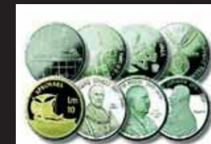
A selection of commemorative gold and silver coins issued by the Bank since 1972.

The Malta Coins Distribution Centre is the sales outlet of the Central Bank of Malta for gold and silver commemorative coins, Maltese banknotes and uncirculated decimal coins. All commemorative coins have a legal tender value in terms of the provisions of the Central Bank of Malta Act 1967.